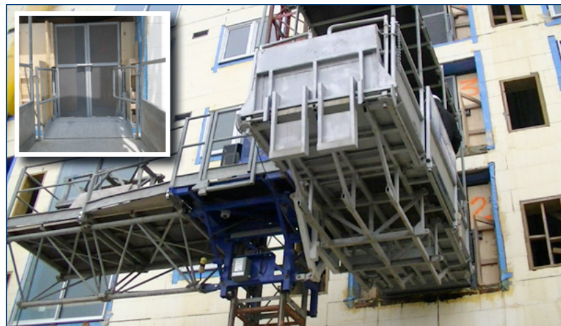
Mechanical interlocks = less maintenance, greater safety.