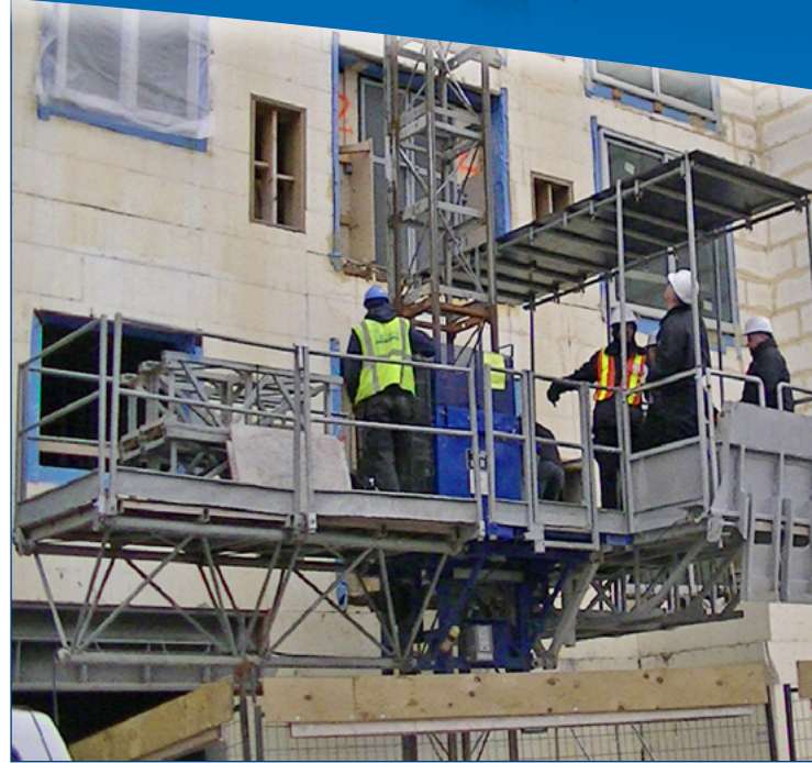
Simple, easy-to-operate control systems and variable speed options.

Klimer's transport platforms feature a spacious platform surface matched with one of three proven climbing systems, driven by self-contained gas or electric power units. Single or dual cars available.