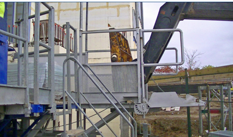
Two end ramps plus one removable side gate speed loading and off-loading.