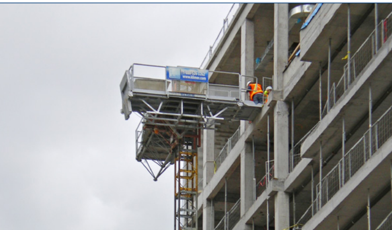
Up to 72 ft freestanding on KTP-5 & KTP-4A. Up to 40 ft freestanding on KTP-4.

Proven mobility and versatile configurations put your crews and materials to work faster.